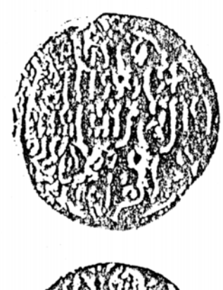
Fig. XI. Coin of Nasiruddin Nusrat Shah

Calligraphic style: Thulth and Tawqi mixed.