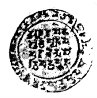
Fig. II. Bilingual type. Arabic and Sarada script Coins of Ghajni Sultan Mahmud.