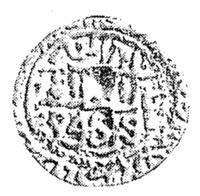
Fig. VII. Coin of Sultan Shams Uddin Ilyas Shah, Calligraphy- Naskh Style.